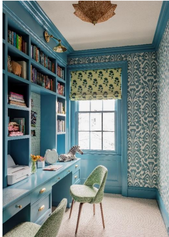
Belfour Cobalt wallpaper, Interiors by Annsley Interiors