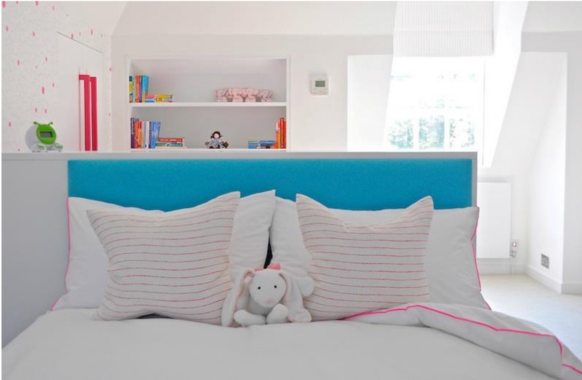
Broken Stripe Hot Pink linen, Interior Design by Cloud Studios