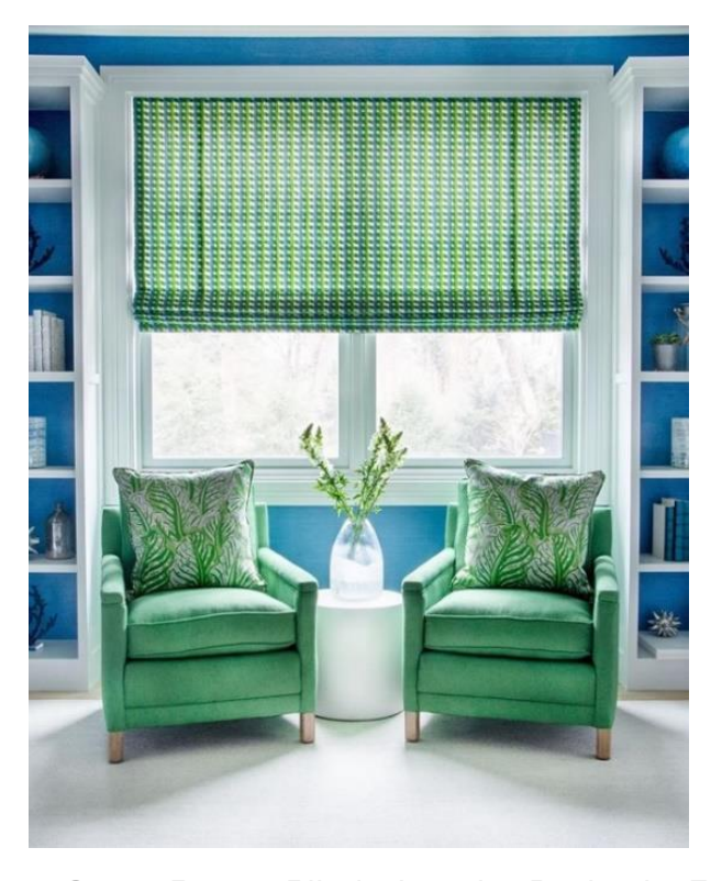
Cremaillere Green Roman Blinds, Interior Design by Tusk Home