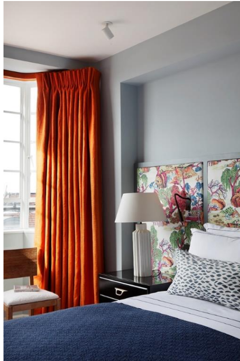
Alto Orange linen curtains, Interiors by Studio Peake, Photography by Alexander James