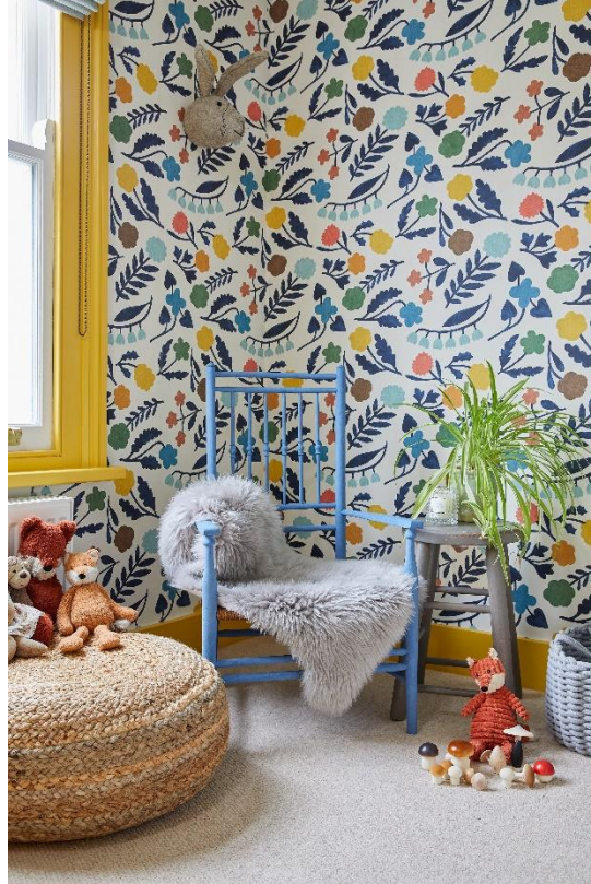
Array Cobalt wallpaper, Interiors by Foxglove House Interiors