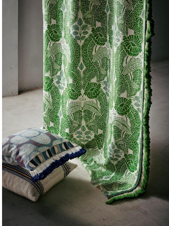
Belle-de-Nuit Green curtains with Ombre Fringe Trim