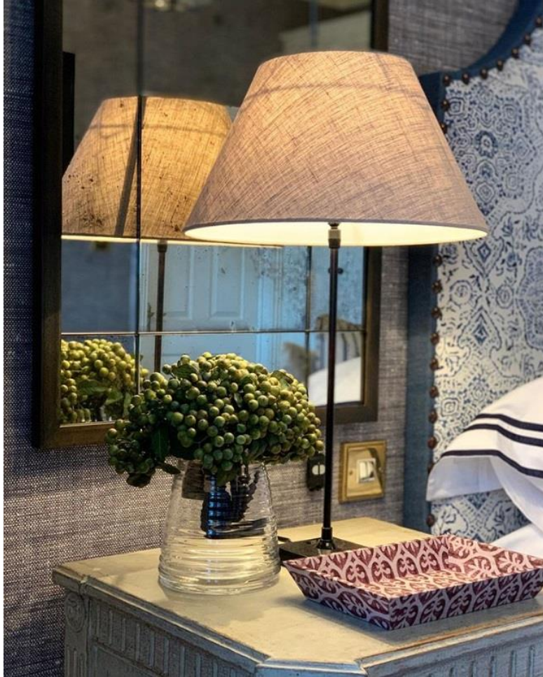
Hemp Cobalt vinyl wallpaper, Interiors by Lauren Elliot