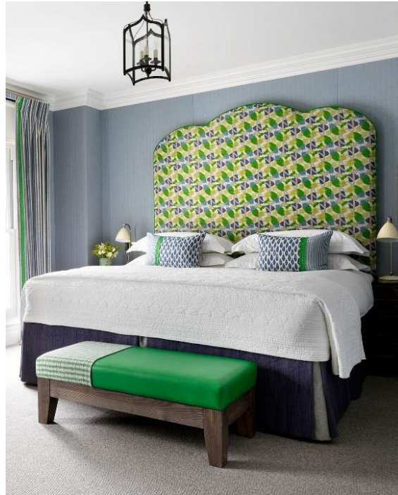
Cactus Flower Green headboard, Interiors by Firmdale Hotels