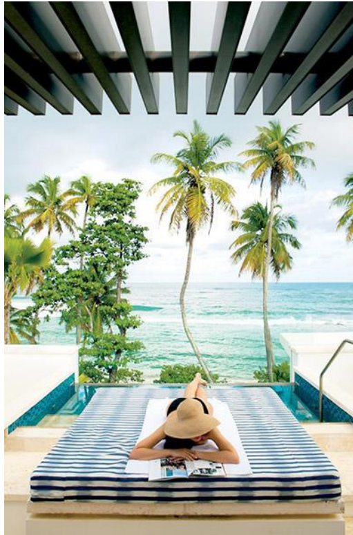
Capri Azzurro Outdoor Fabric, Ritz Hotel