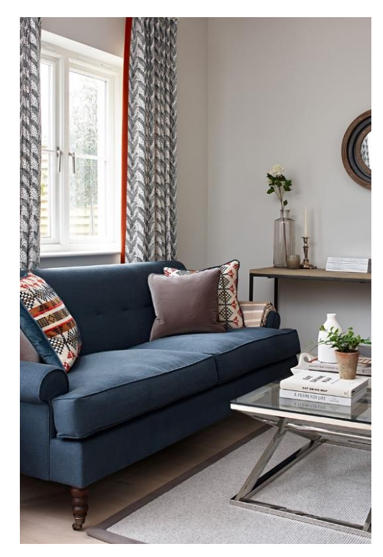
Carnac Dark Indigo Curtains, Interiors by Sims Hilditch