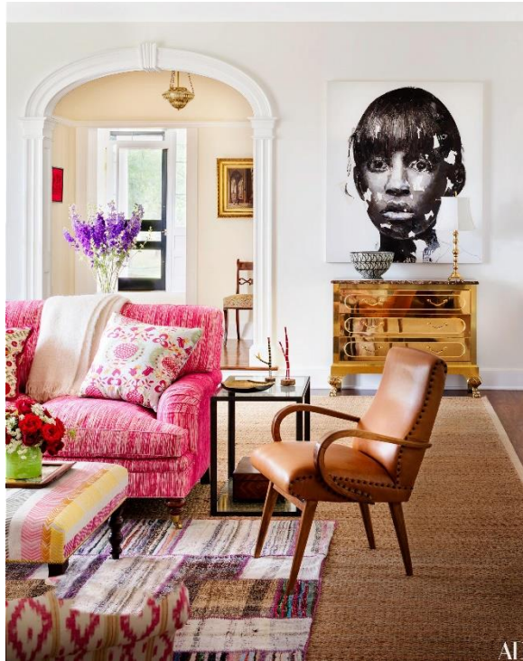
Downey Hot Pink Flocked Linen, AD