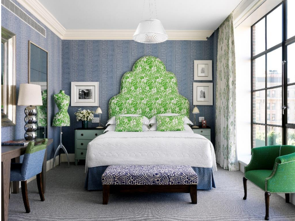
Flours Etoiles Green linen headboard, Interiors by Firmdale Hotels