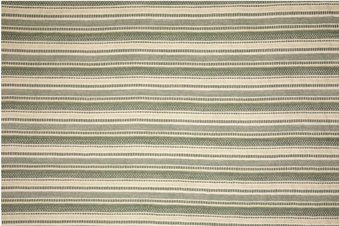
Go with the Flow Olive Fabric by Kit Kemp