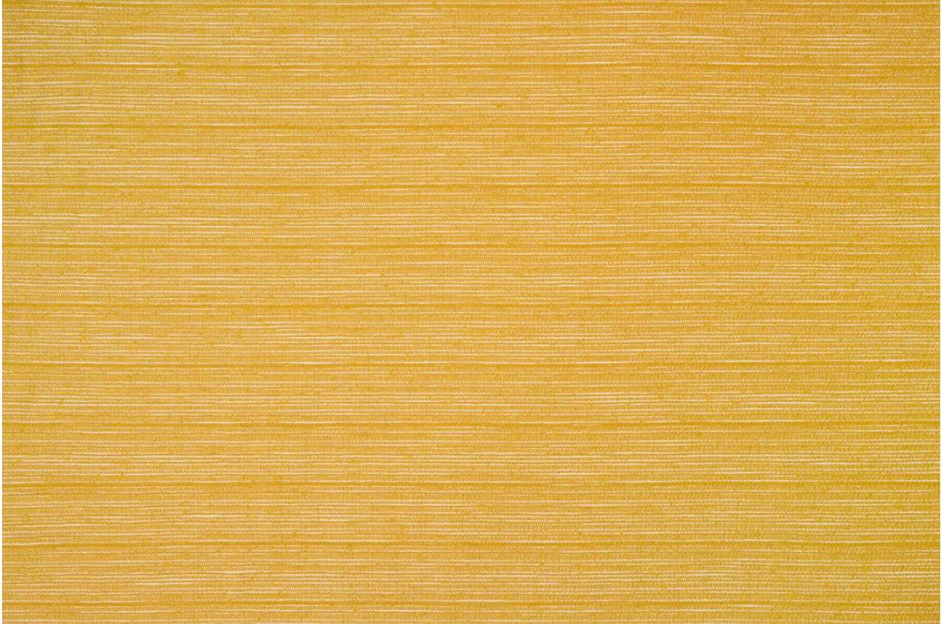
Hippie Lemon Fabric