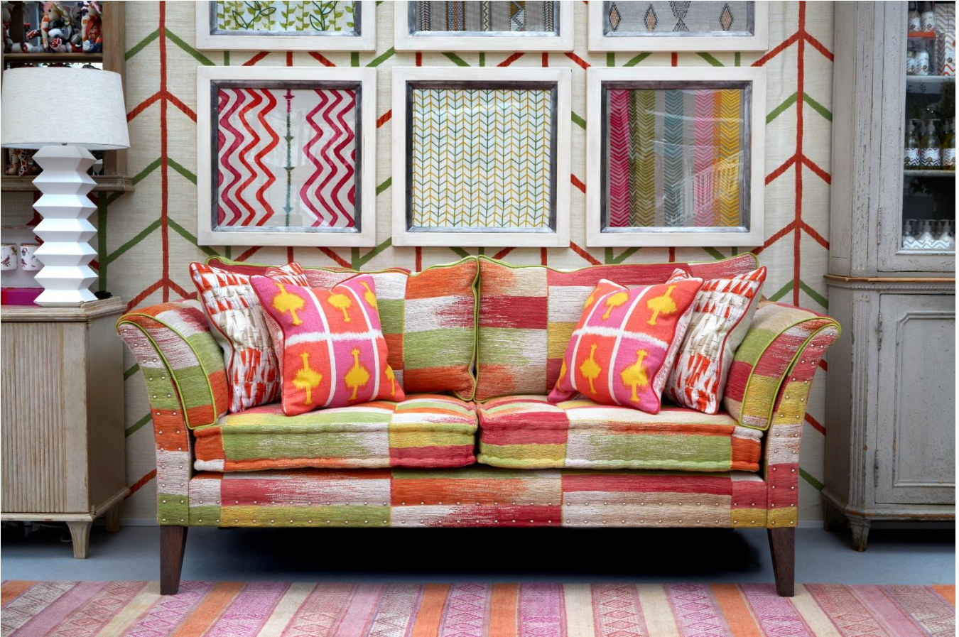
Ikat Weave Lime Upholstery, Design by Kit Kemp