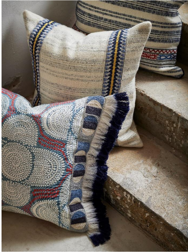
Japura Pale Blue and Indigo Cushions