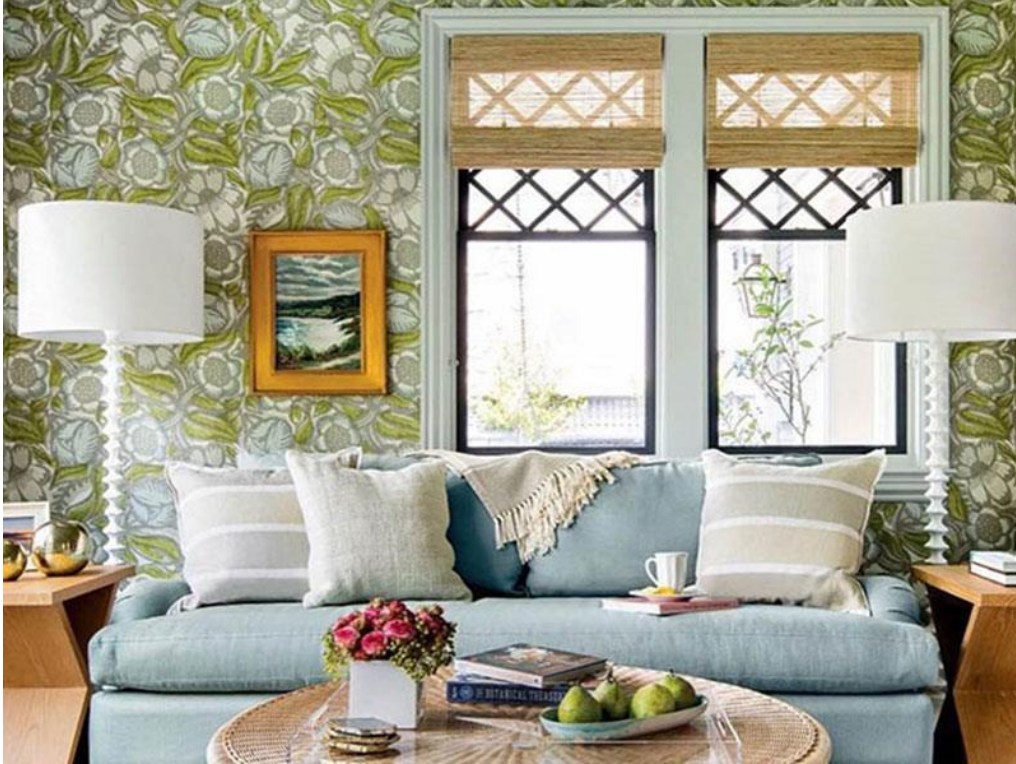
La Foret Fennel Wallpaper, Interiors by Studio Munroe