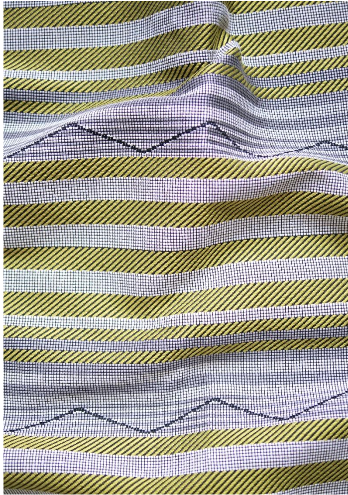
Mare D'oro Outdoor Fabric