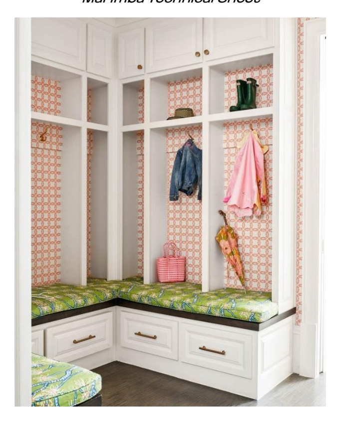
Marimba Apricot Wallpaper, Interiors by Jenkins Interiors