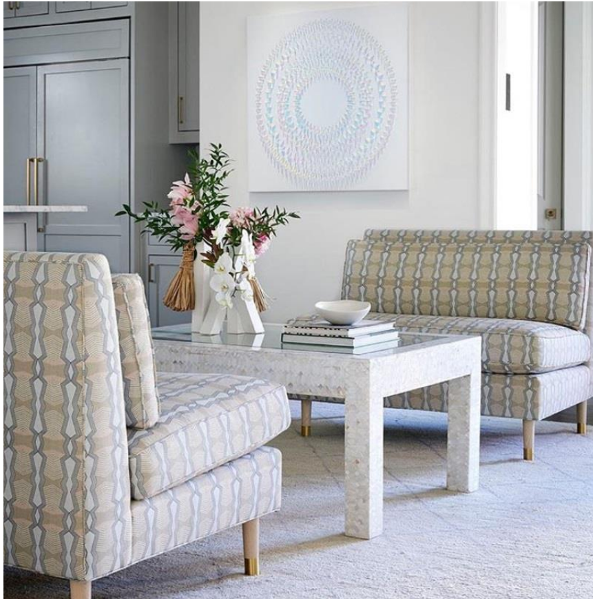
Memphis Natural linen Upholstery, Interior Design by Tracy Hardenburg Design