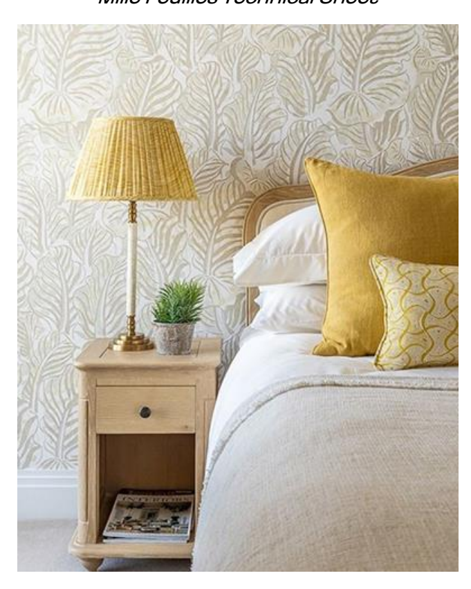
Mille Feuilles Slate Wallpaper, Interiors by Studio Hydrox