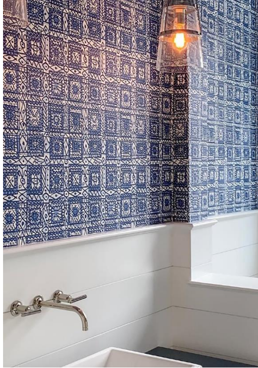
Mosaic Cobalt Wallpaper, Interiors by Pineapple Design Group