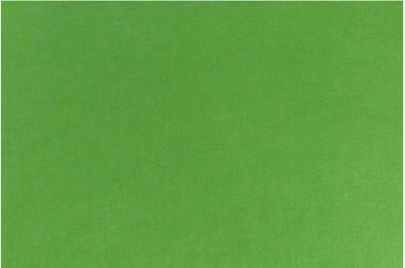
Pebble Green Linen