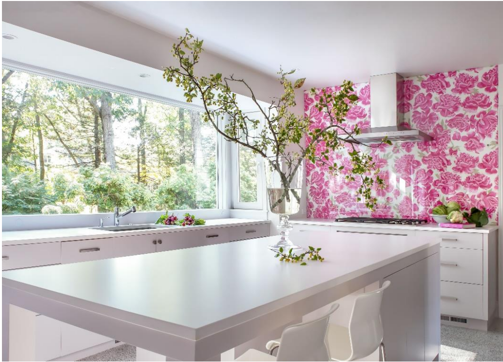
Peonies Fuchsia Wallpaper, Interiors Abby Yozell LLC