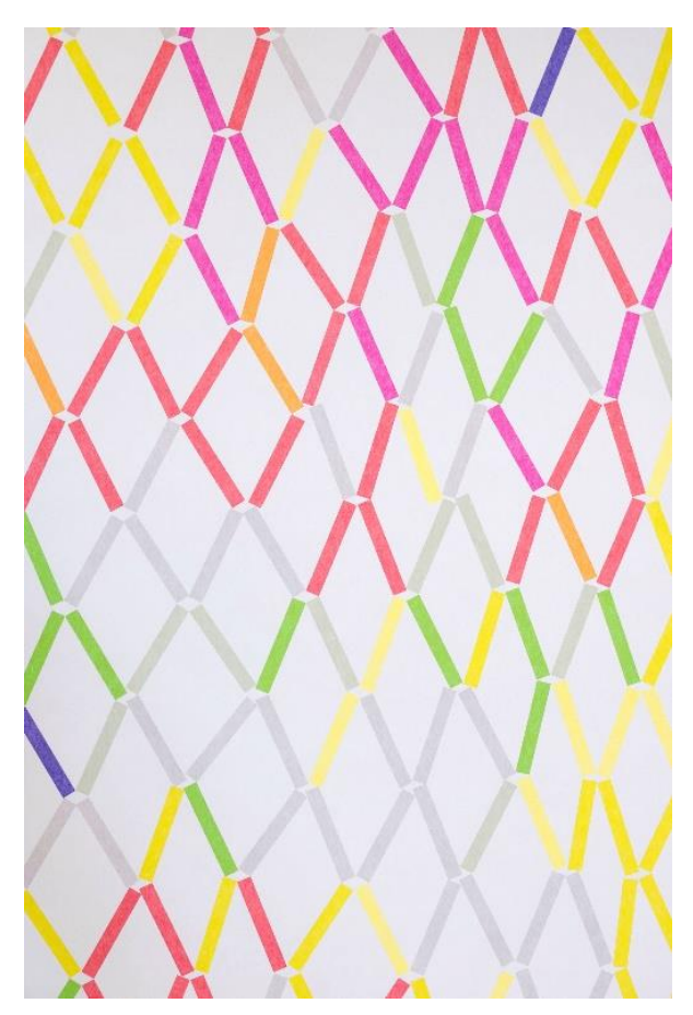
Porto Fuchsia Wallpaper