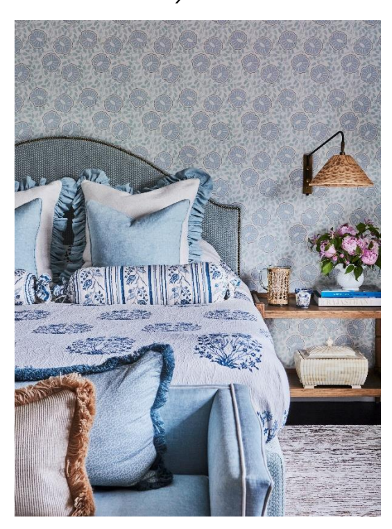
Punch Paisley Sky Wallpaper, Interiors by Elizabeth Hay Design