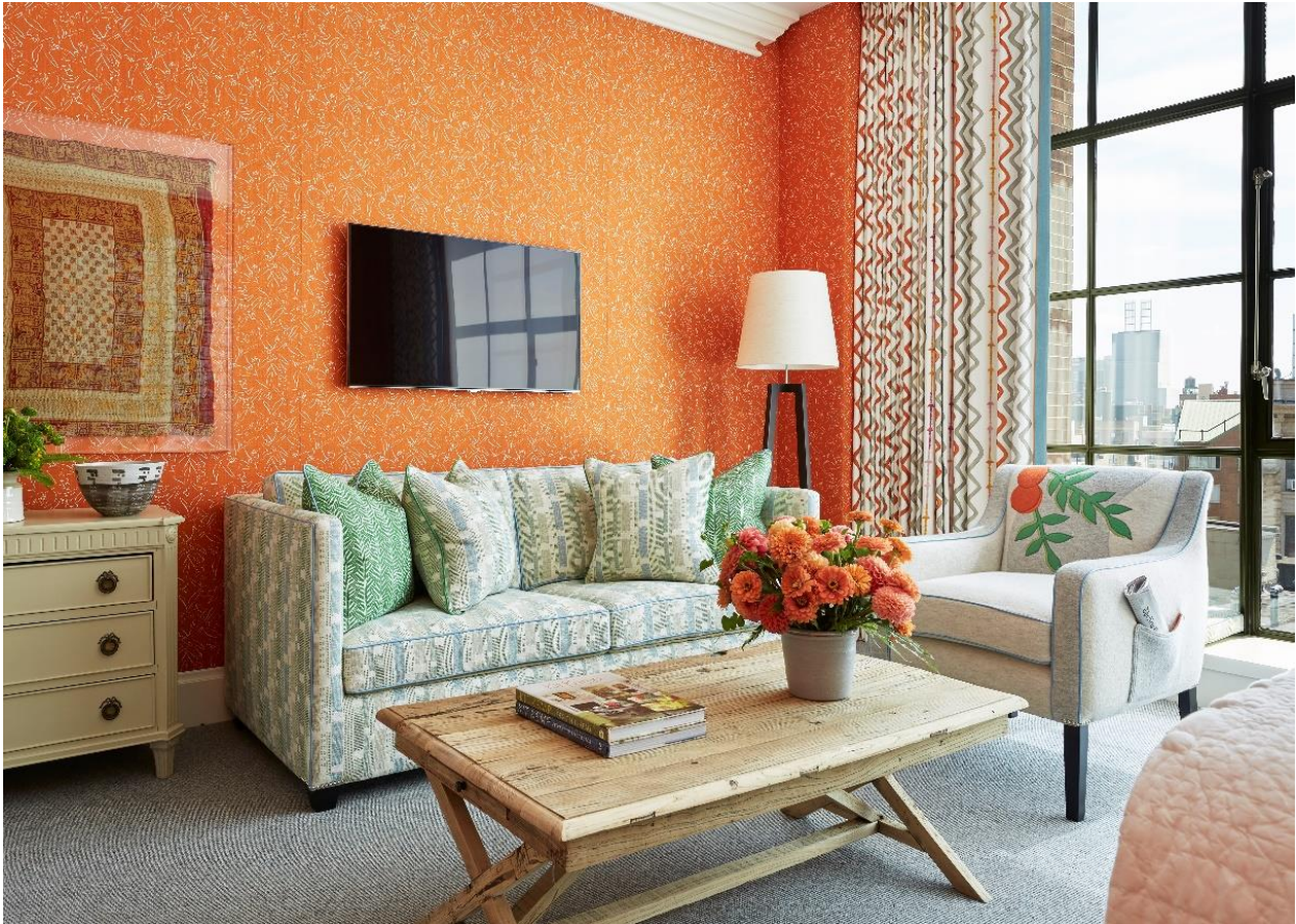
Rick Rack Orange linen, Interior Design by Firmdale Hotels