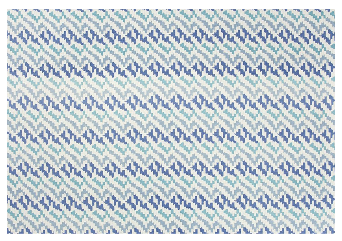
Ripple Denim Linen