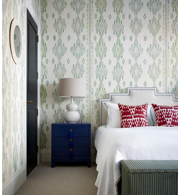
Travelling Light Grass Wallpaper, Interior design by Turner Pocock