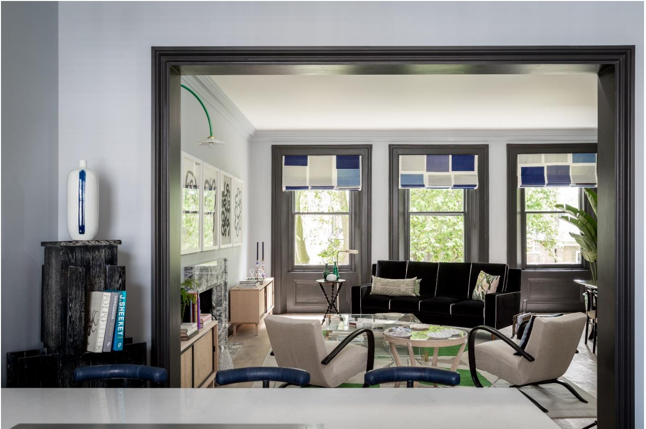
Untitled Indigo linen roman blinds, Interior Design by Kitesgrove