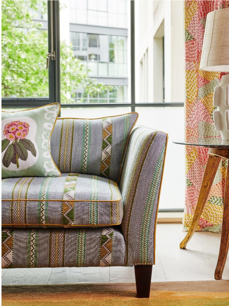
Woven Ribbon Aqua by Kit Kemp