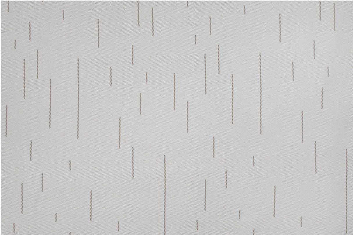
With Verticals Natural