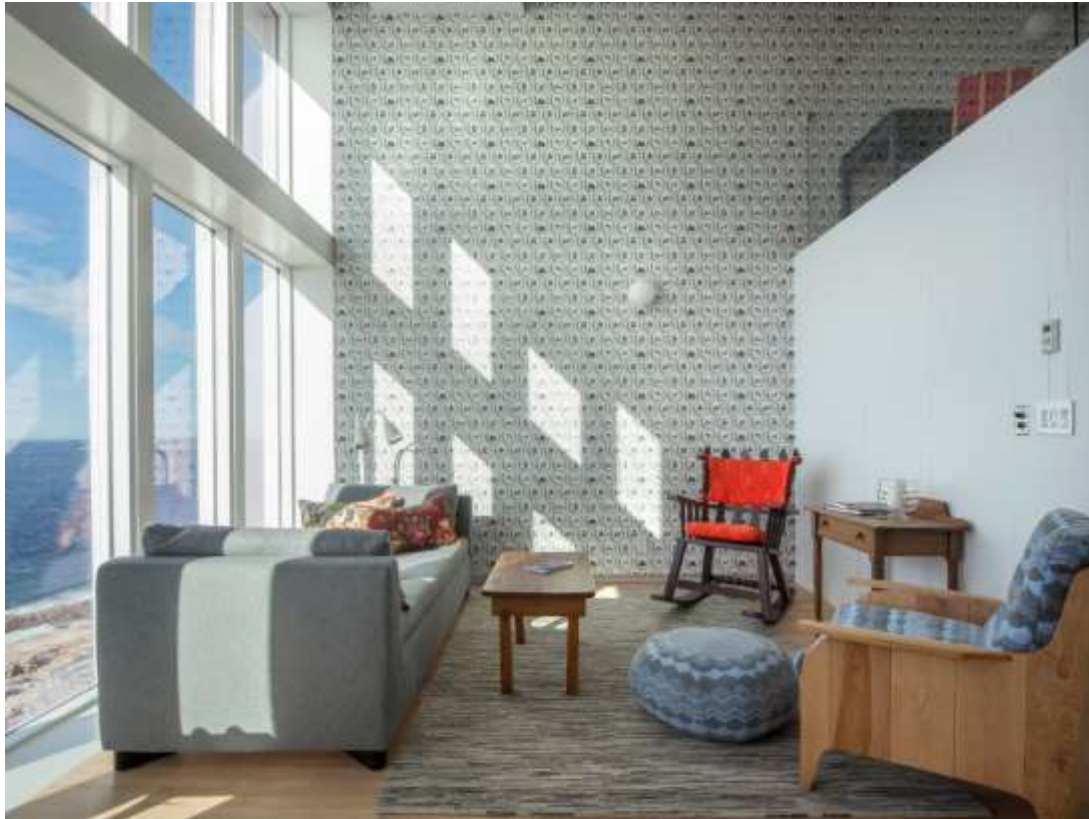
Set the Scene custom wallpaper at the Fogo Island Inn