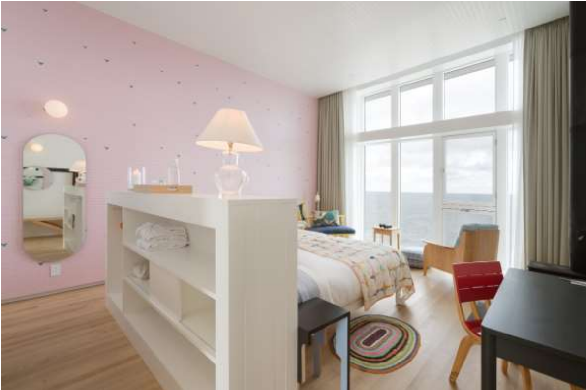
We Sailed Away custom wallpaper at the Fogo Island Inn