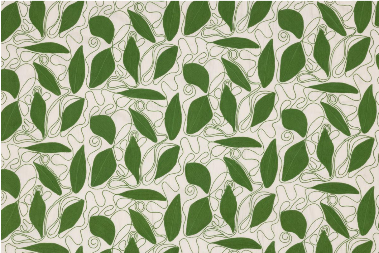
Foliage Green by Veronique de Soultrait