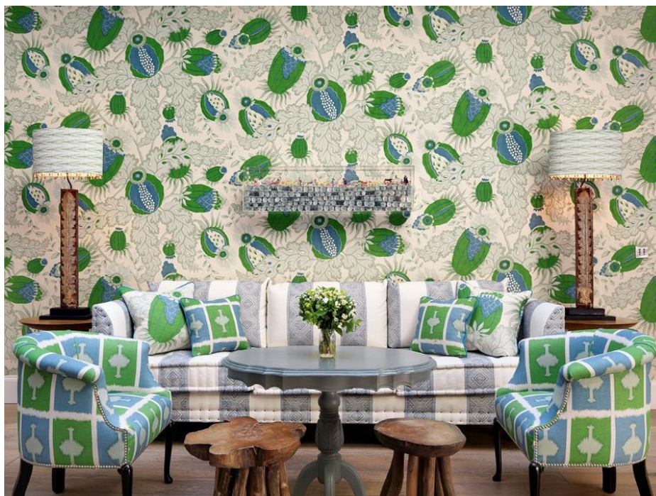
Carnival Grass wallpaper and Ozone Green Upholstery, Interiors by Firmdale Hotels